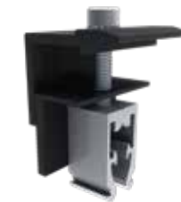
UNIVERSAL END CLAMP

2 clamps for modules from 30-45mm or 38-50mm thick