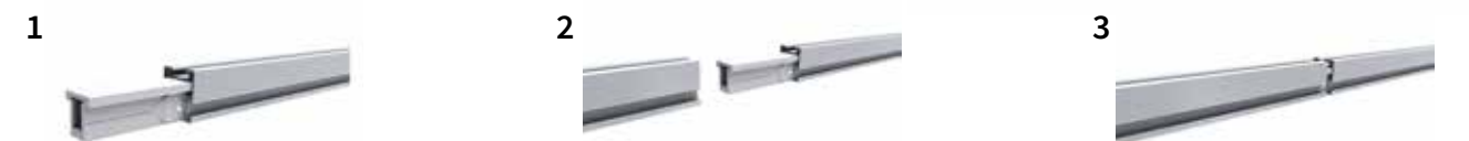
Installs in seconds — no tools or hardware required

QRail's innovative internal QSplice installs in seconds, requiring no tools or screws. Simply insert QSplice into the rail and slide the other rail on to create a fully structural, bonded splice. An external splice is also available.