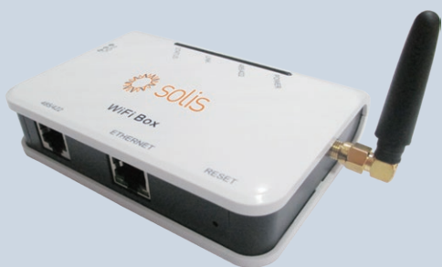
Data Logging Box DLB