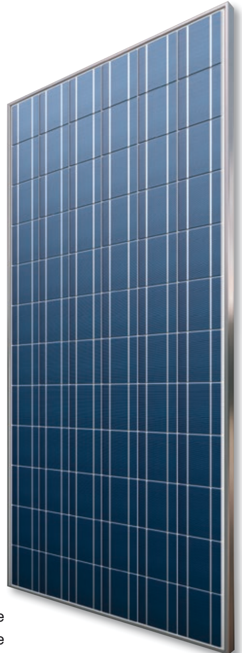
Fig. similar 72P156USA150608A

IP 67 High quality junction box and connector system for a longer life time